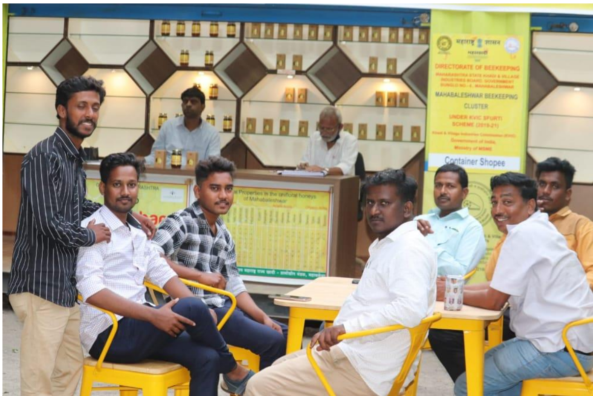
Directorate of Beekeeping, Mahabaleshwar - Students learning about beekeeping